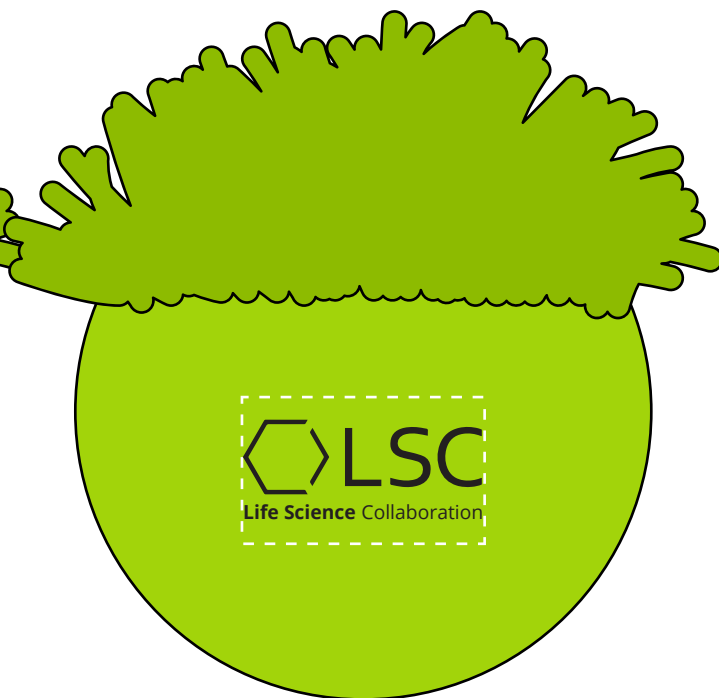
OPTION 2 TEXT ENLARGED IN ORDER TO PRINT LEGIBLY

Please proof carefully for spelling errors, omissions, and layout accuracy. It is your responsibility to correct any errors. Garrett Specialties assumes no responsibility for errors after a proof has been authorized to print. Please note changes or revisions to your proof from your original instructions may cause revision in your ship date. Delays in paper proof approval also may require a change in your schedule ship dates. Occasionally, some fax machines may distort the image. Please pay close attention to numbers.