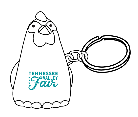
OPTION 2 PREVIOUS ARTWORK JUST SHOWING AS AN OPTION BECAUSE IT WIL PROBABLY BE MORE LEGIBLE WHEN PRINTED THAN OPTION 1