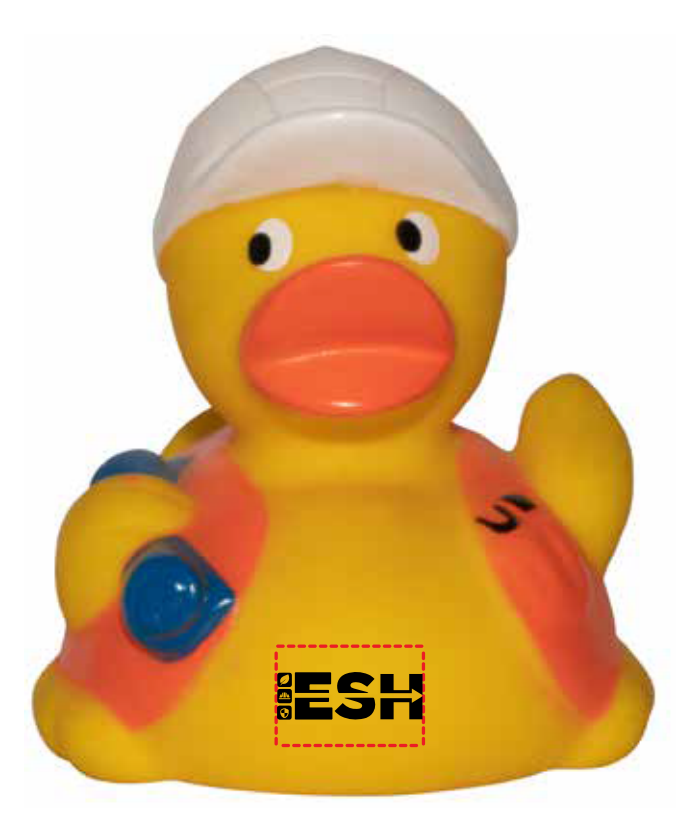
Actual Size of Imprint Dotted Lines Do Not Print

Note: the images inside of the 3 icons on the left will most likely fill in because of hw small they are. Please advise o how you'd liek to proceed.