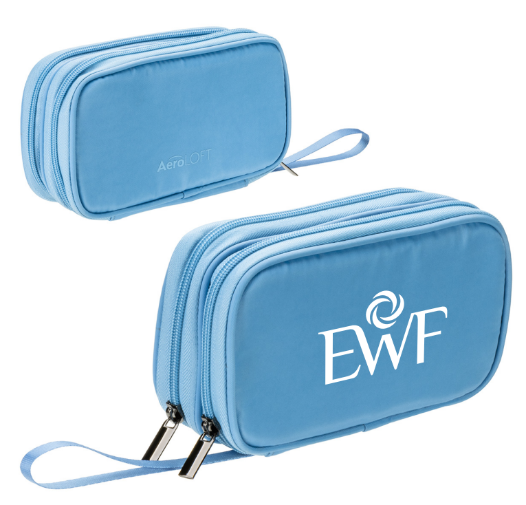
Graphic is for placement only Not to scale