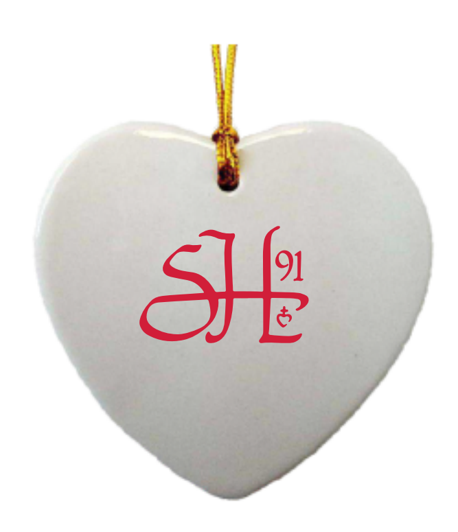
Actual Size of Imprint Dotted Lines Do Not Print

Imprint Method: Screen Print on the Front: Red 186