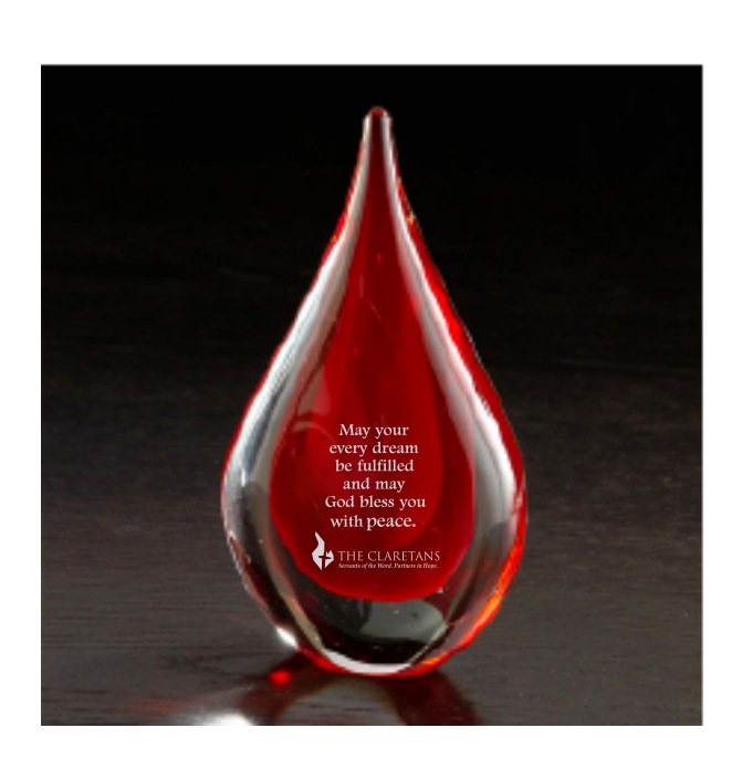
Graphic is for placement only Not to scale