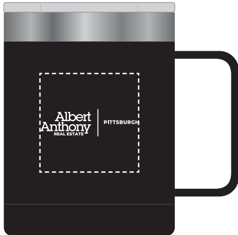
Graphic is for placement only Not to scale