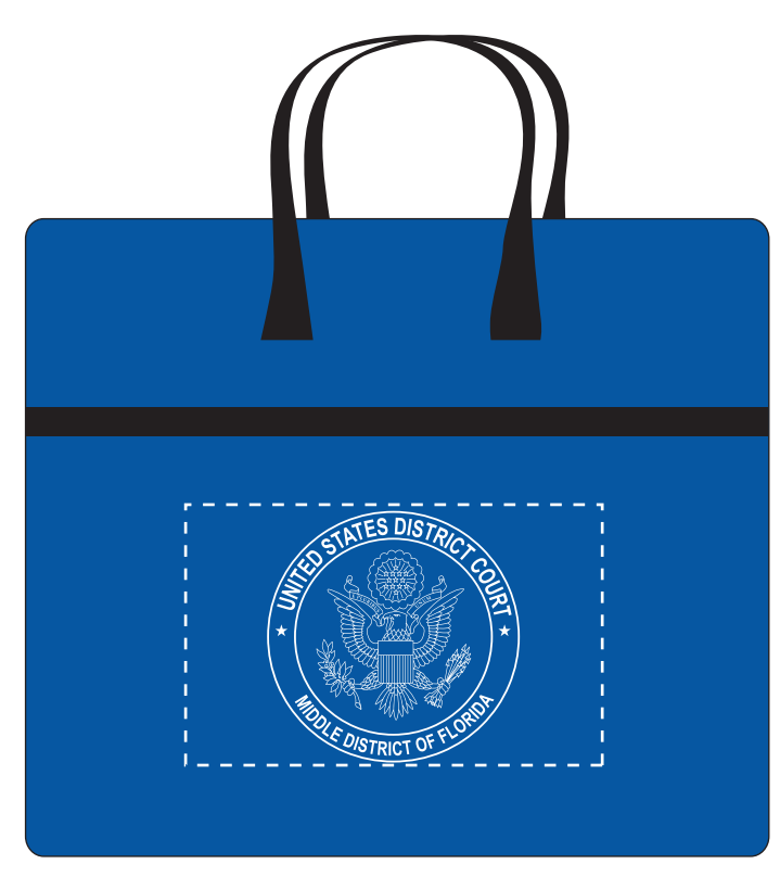
Item shown @ 25% of actual size