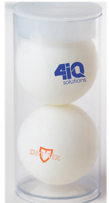
Graphic is for placement only not to scale