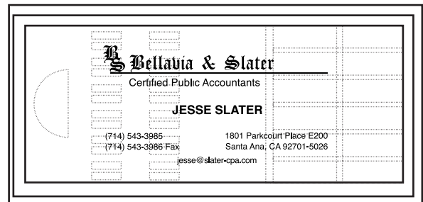
Graphic is for placement only not to scale