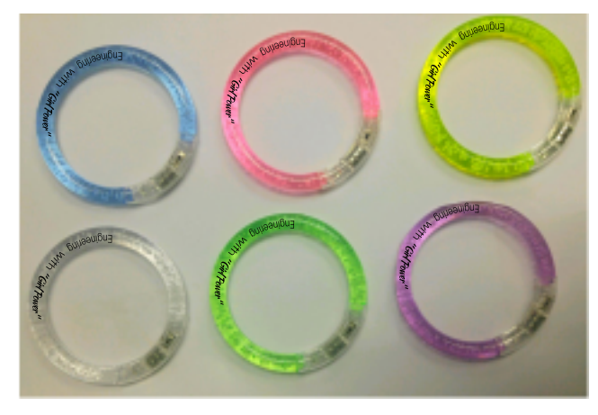
Graphic is for placement only not to scale