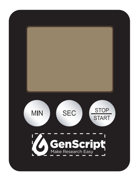
100 % OF ACTUAL SIZE