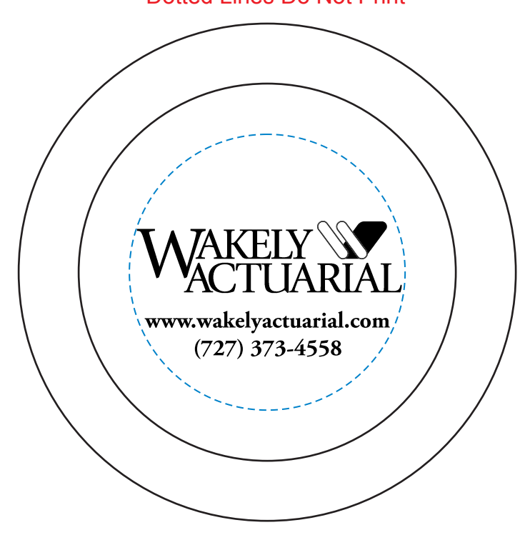
Image Not To Size For Reference Only Laser Engrave color for refrence only

Actual Size of Imprint Dotted Lines Do Not Print