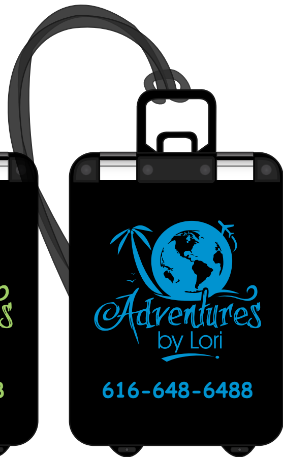
Option 2- Process Blue Print