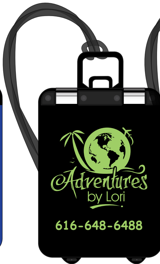
Option 1- Lime Green Print