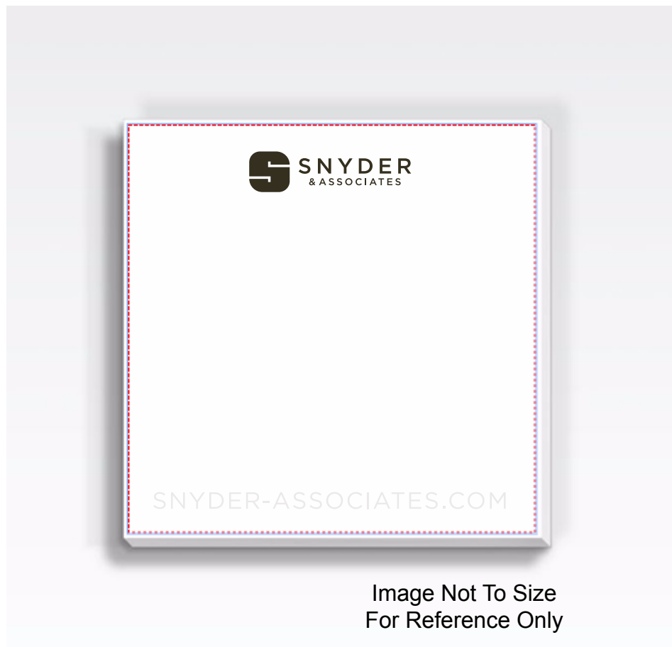
Image Not To Size For Reference Only

Bic 3 x 3 Sticky Notes 25 Sheets 20% Opacity