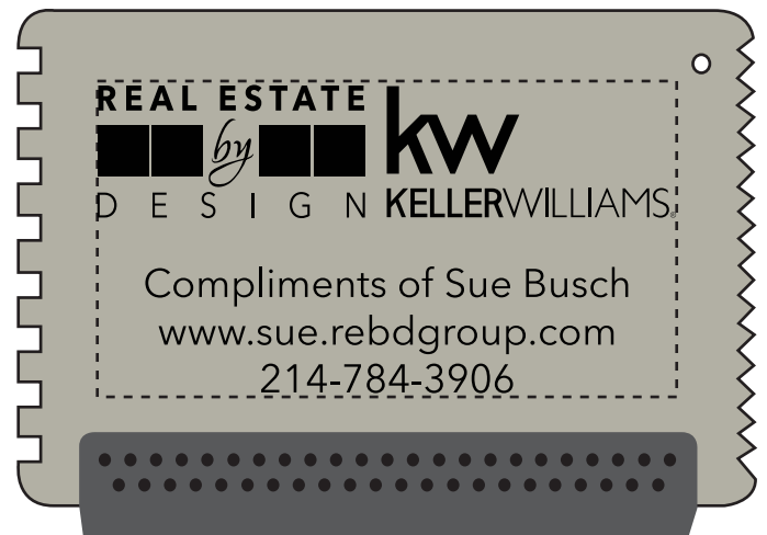
Actual Size of Imprint Dotted Lines Do Not Print