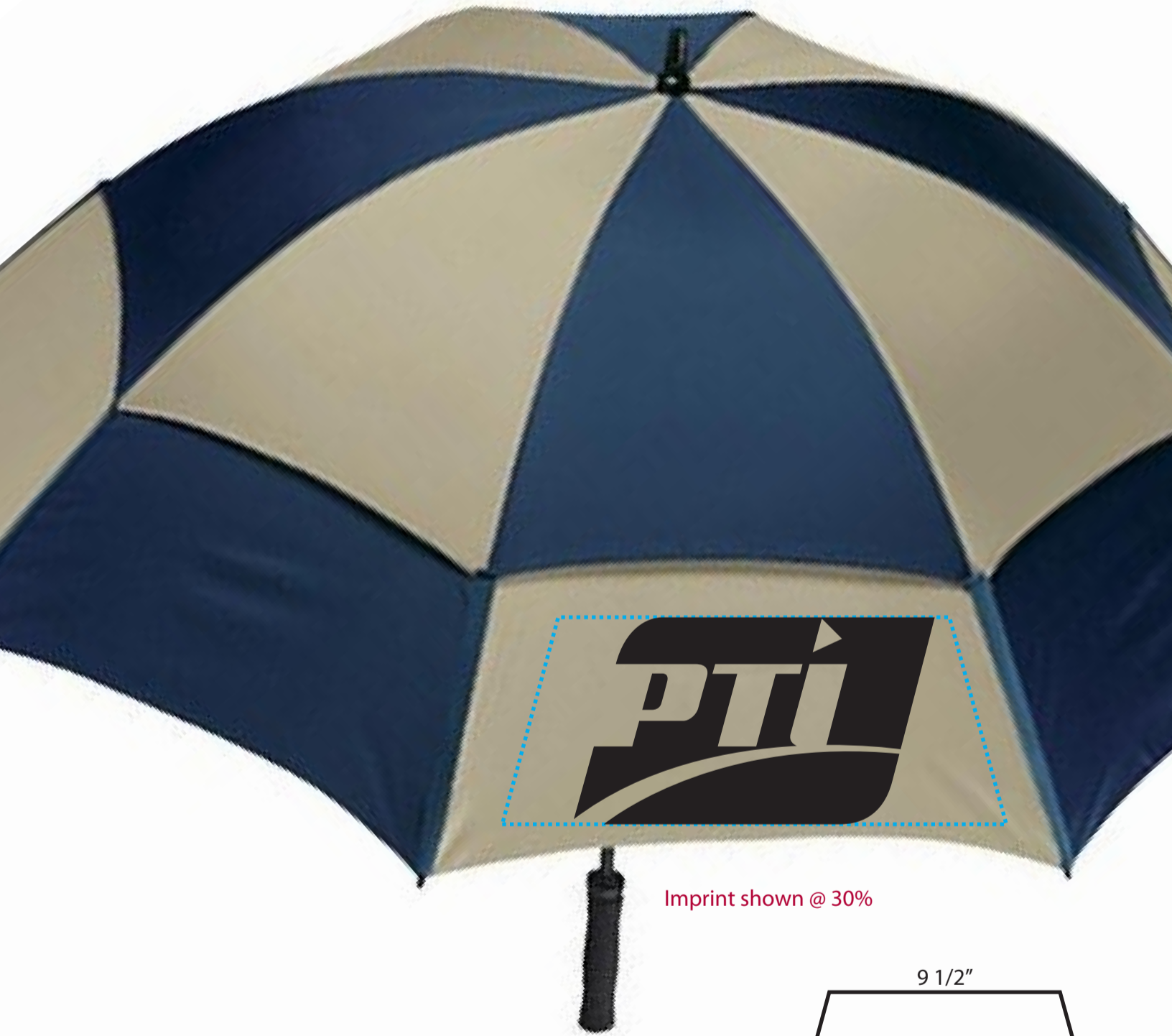
Imprint shown @ 30%