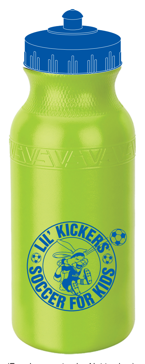
(For placement only. Not to size.)