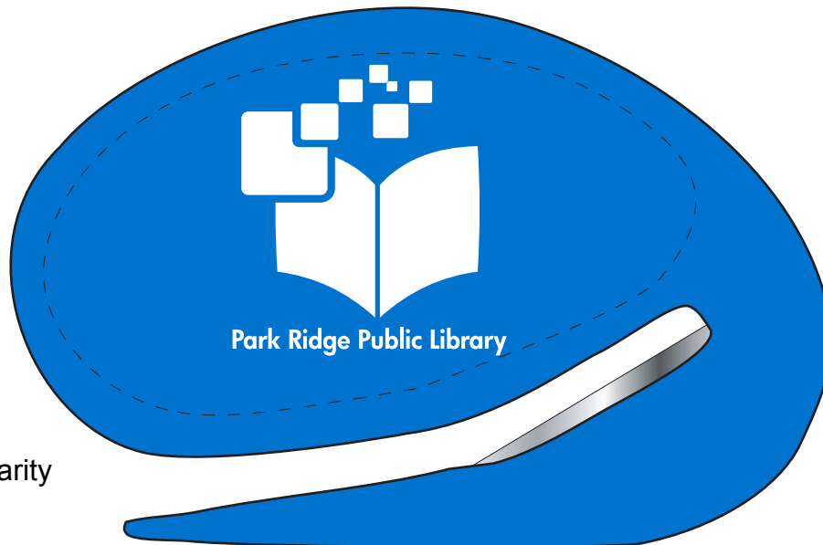
Enlarged for Clarity