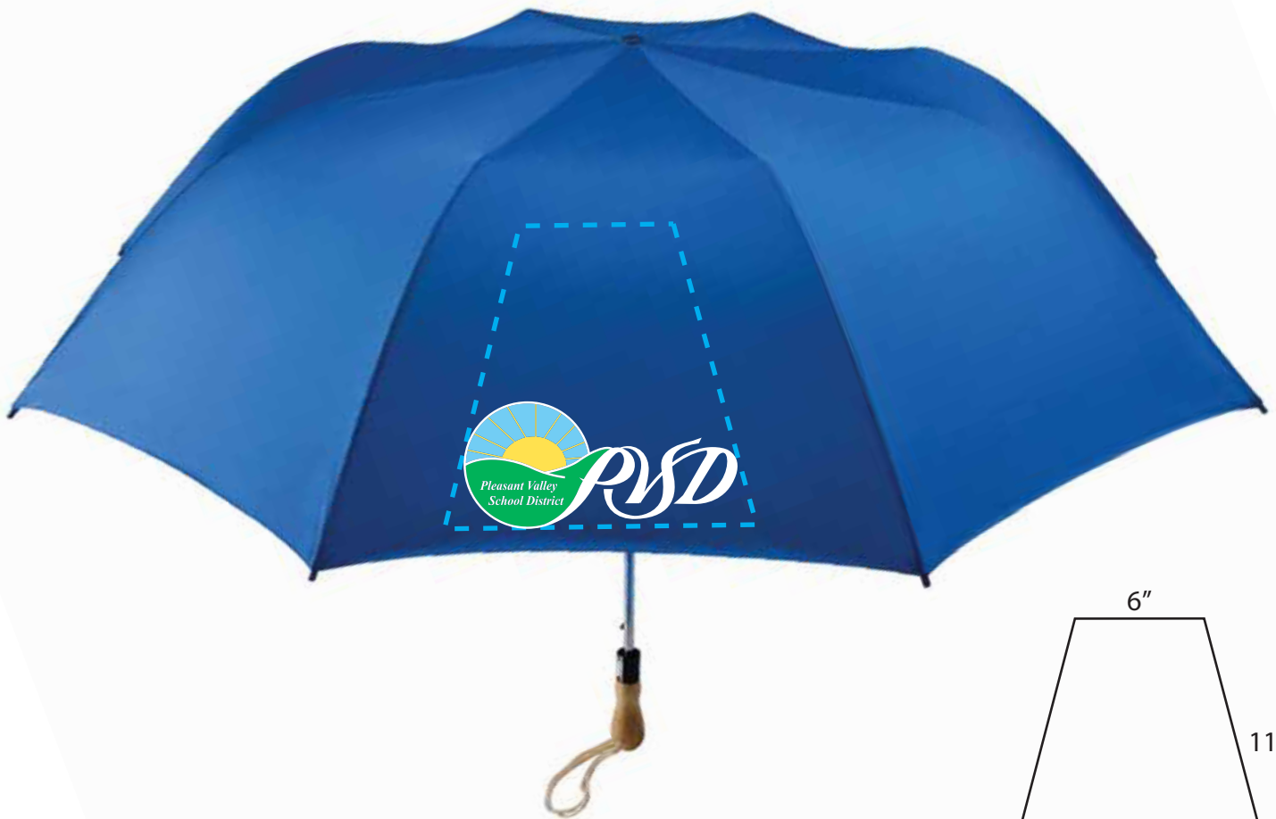
Imprint shown @ 15% of Actual Size

Order#: 128780 Product: Traveler Large Auto-Open Folding Umbrella Item #: 1039-101118 Imprint Method: Screen Print White, Yellow PMS 115, Blue PMS 297, Green PMS 354