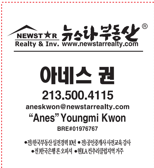
Actual Size of Imprint Dotted Lines Do Not Print