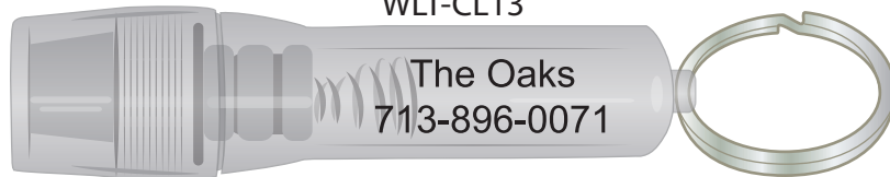
Clear Twist LED Light WLT-CL13