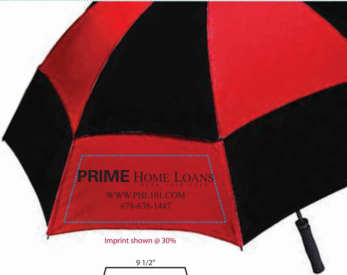
Imprint shown @ 30%

Imprint Method: Screen Print on the Front Panel - Black