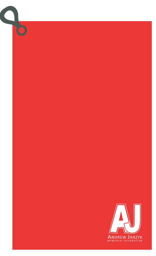
Item shown @ 25% Enlarge @ 400% to see actual size

Imprint Method : Heat Transfer on the Front - White