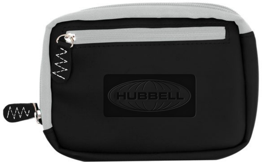
Image for representation only. Debossing may appear differently than this virtual representation. Image Not To Size For Reference Only