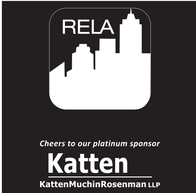
100% to scale

Order#: 124975 Product: Napa Wine Kit Item #: 1061-312144 Imprint Method: Screen Print - White