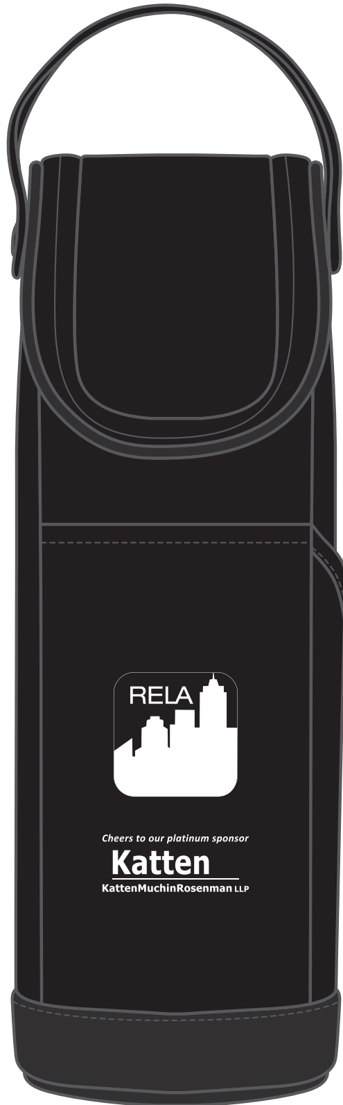
55% to scale