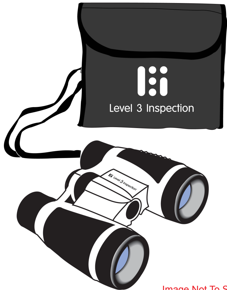
Image Not To Size For Reference Only