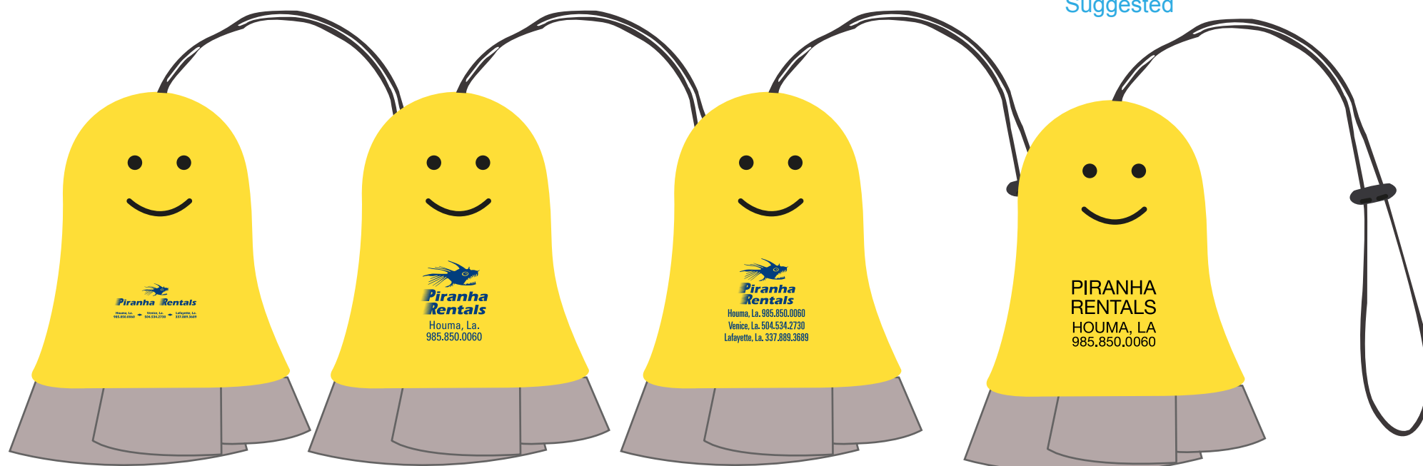
OPTION 4 Suggested

Please be advised that some intricate details and fine lines in the "Piranha Rental" & "Fish" artwork may fill in randomly in all three options, Places & Phn No. will not legible in Option 1 & 3. We will require your permission to print as is.