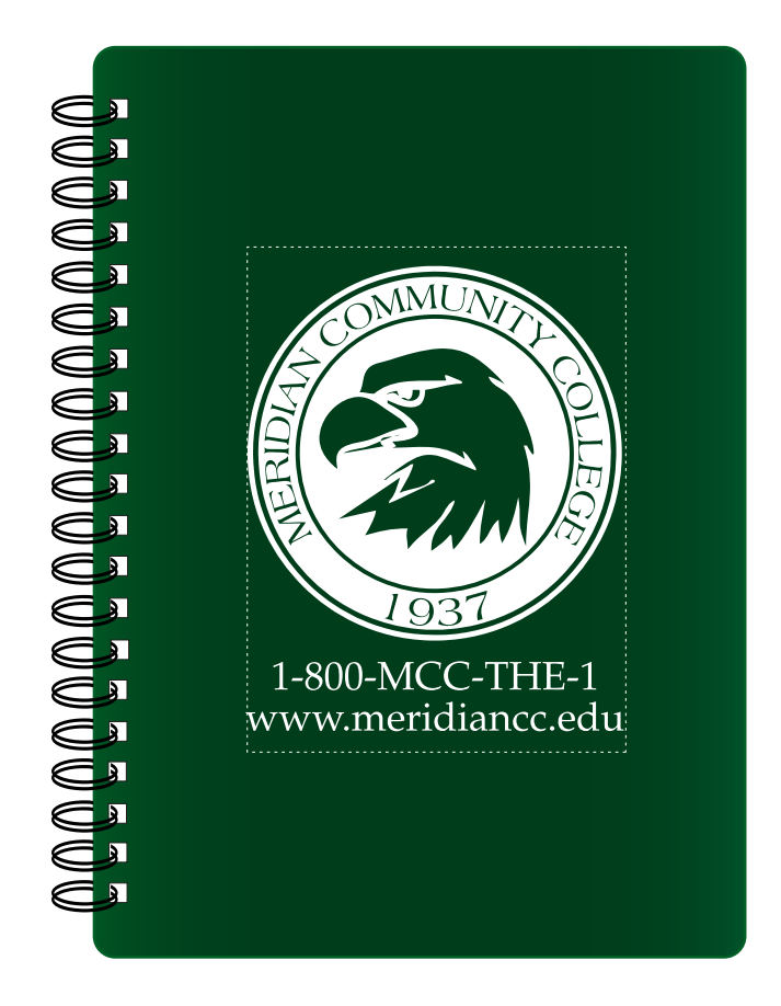
60% OF ACTUAL SIZE

Imprint Method: Screen on the Front - White