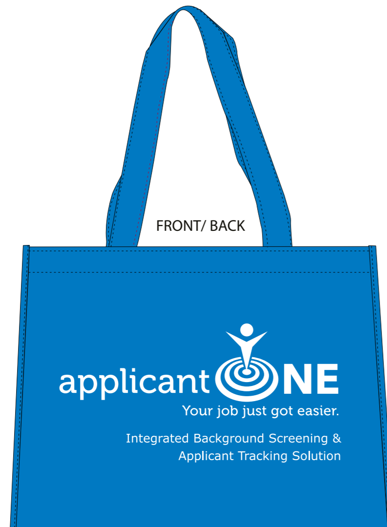
***TOTE BAG DISPLAYED AT 25% FOR VIEWING.***

Order#: 124026 Product: Tropic Breeze Tote Bag - Blue Item #: 1008-305966 Imprint Method: Screen Print on the Front - White