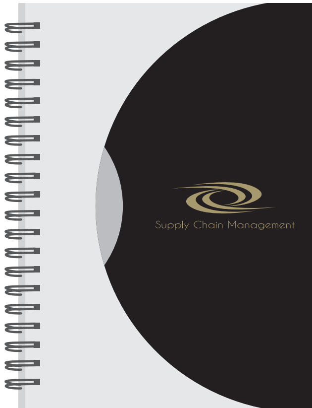
Item shown @ 65% Enlarge @ 153.8% to see actual size

Imprint Method: Pad Print on the Front Side - Metallic Gold 873