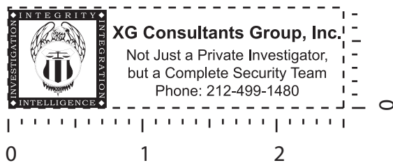
OPTION 2 (suggested)