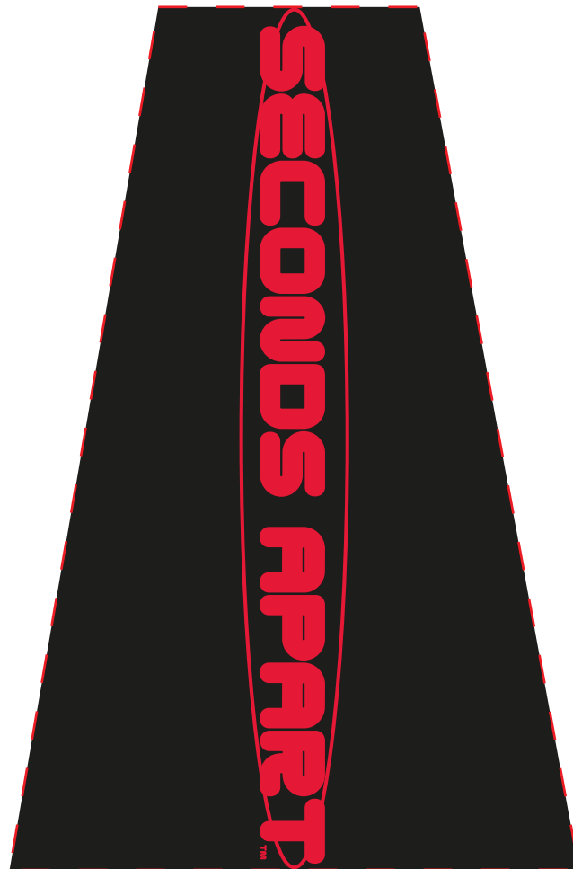
NOTE: Red may not pop as well on black