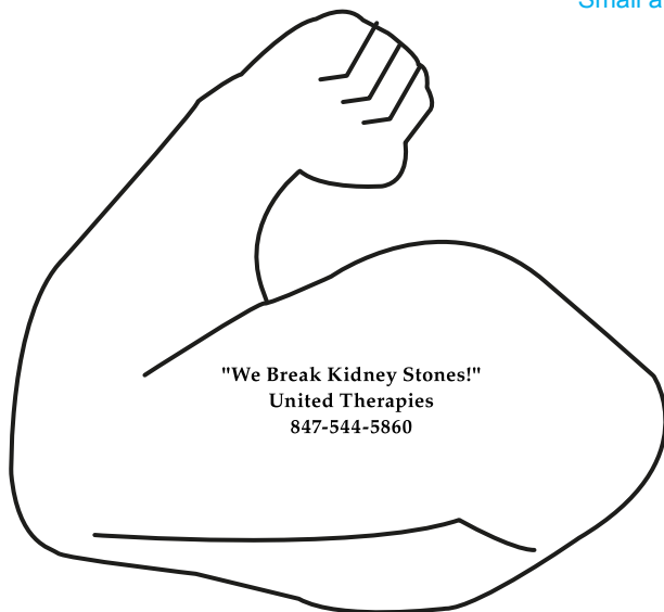
inside of arm