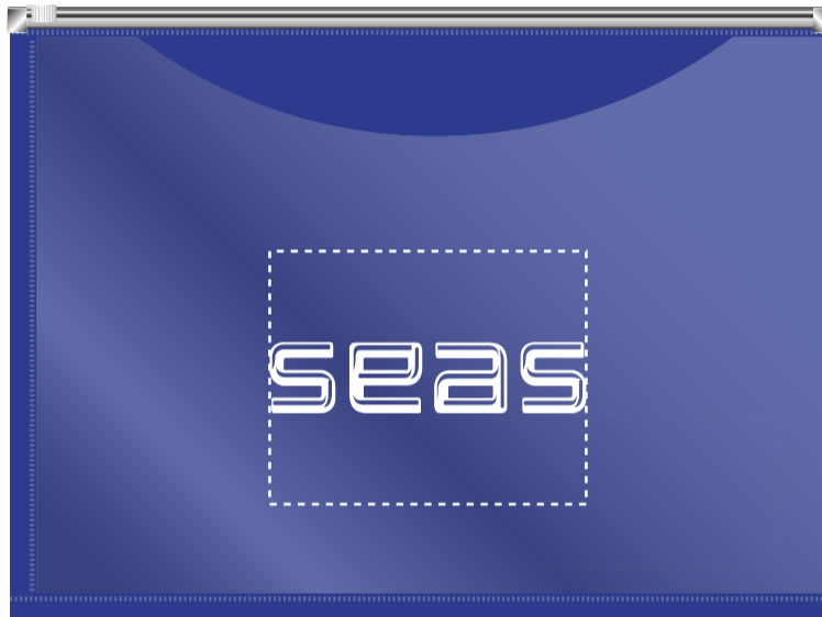
30 % OF ACTUAL SIZE

Imprint Method: Screen Print on the Front - White