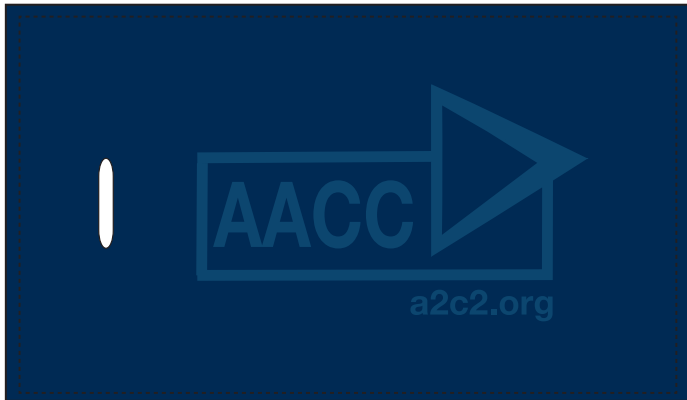
Item shown @ 75% Enlarge @ 133.3% to see actual size