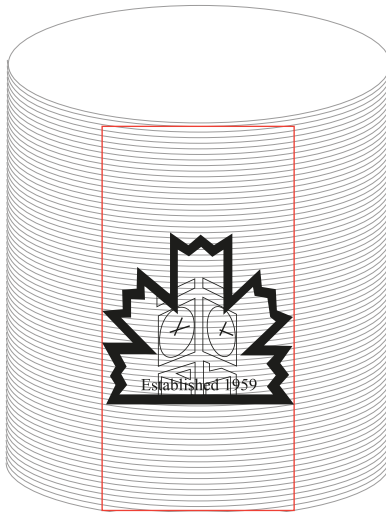
Side - 2