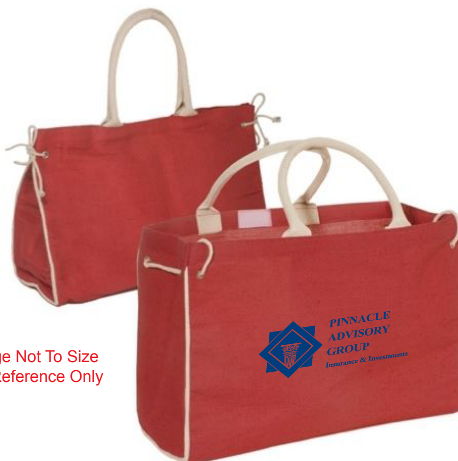
Image Not To Size For Reference Only