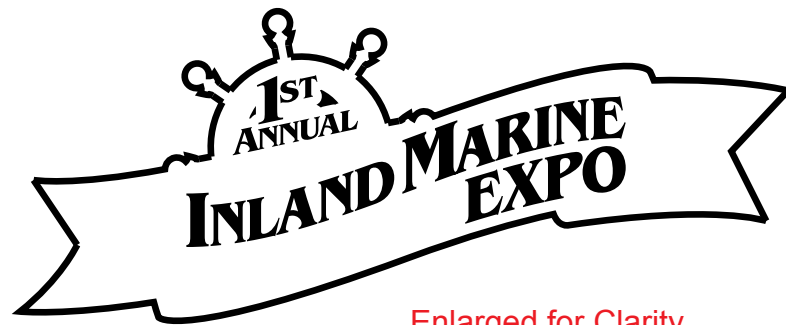
Enlarged for Clarity