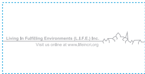
OPTION 2 (SUGGESTED) (white imprint)

Actual Size of Imprint Dotted Lines Do Not Print 2.5" x 1.25"