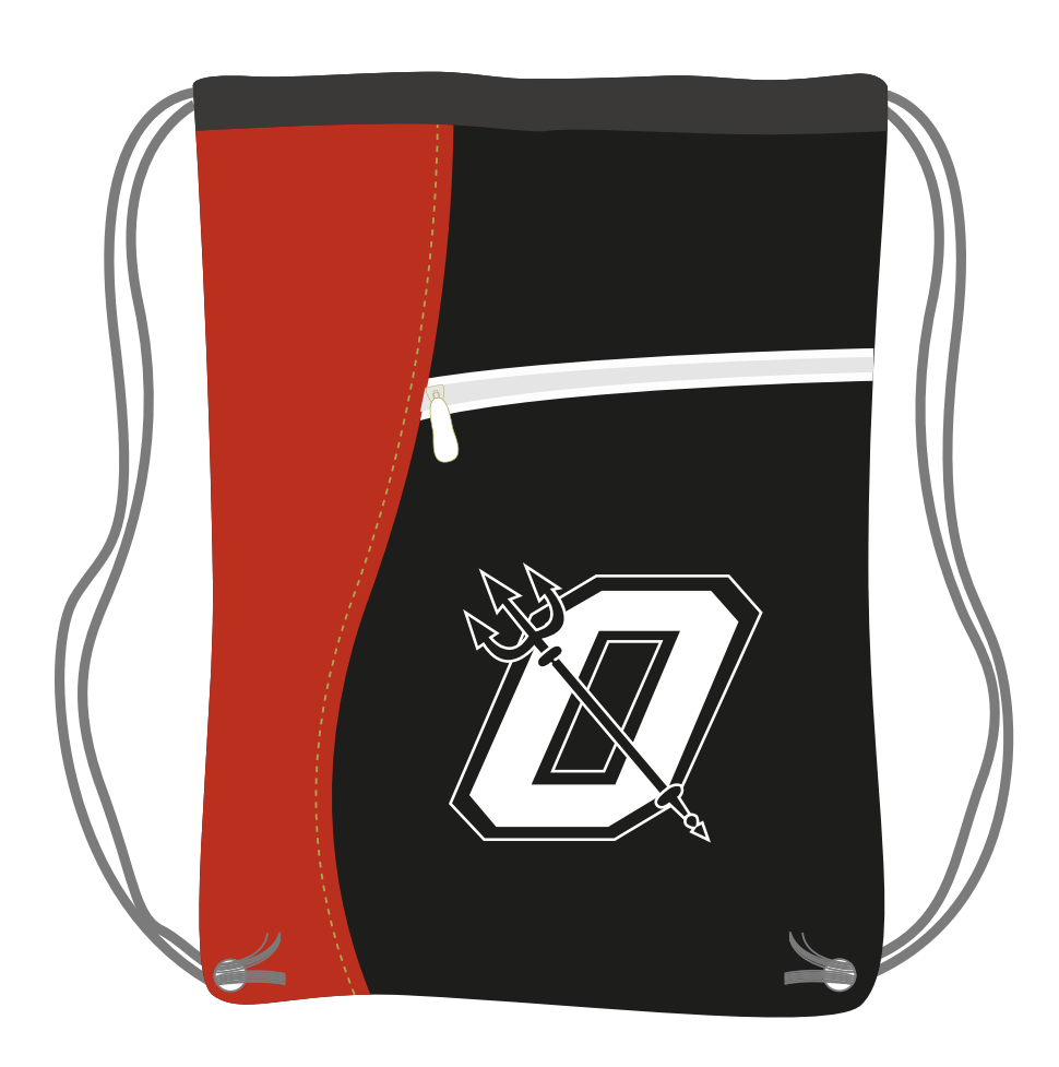
Item shown @ 25% Enlarge @ 400% to see actual size

"for measurement only logo will be imprinted center position on item (see template layout)"