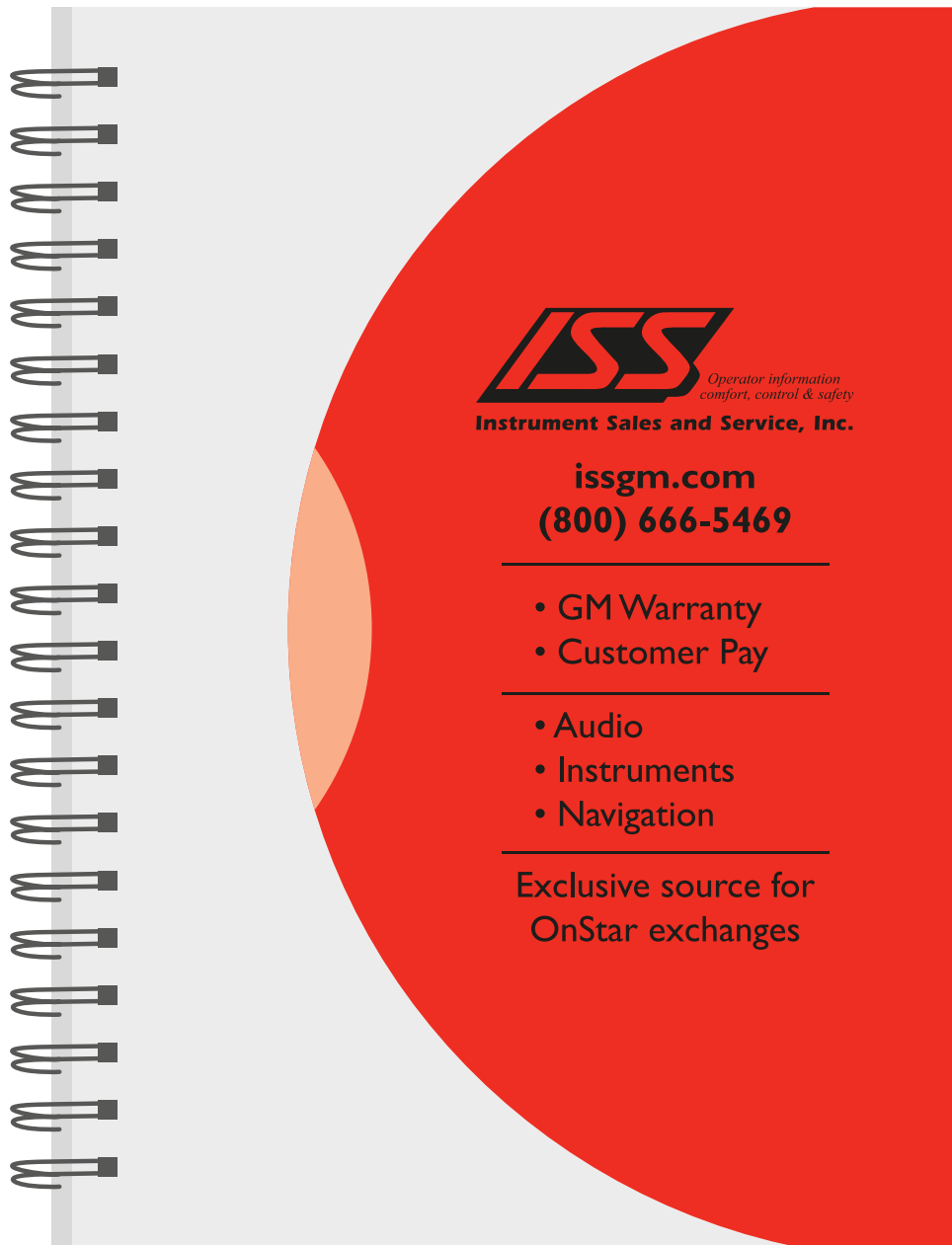
OPTION 2 (RECOMMENDED)