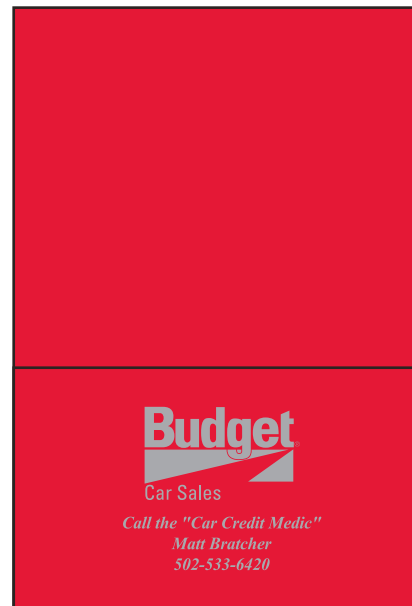
Shown from front view.