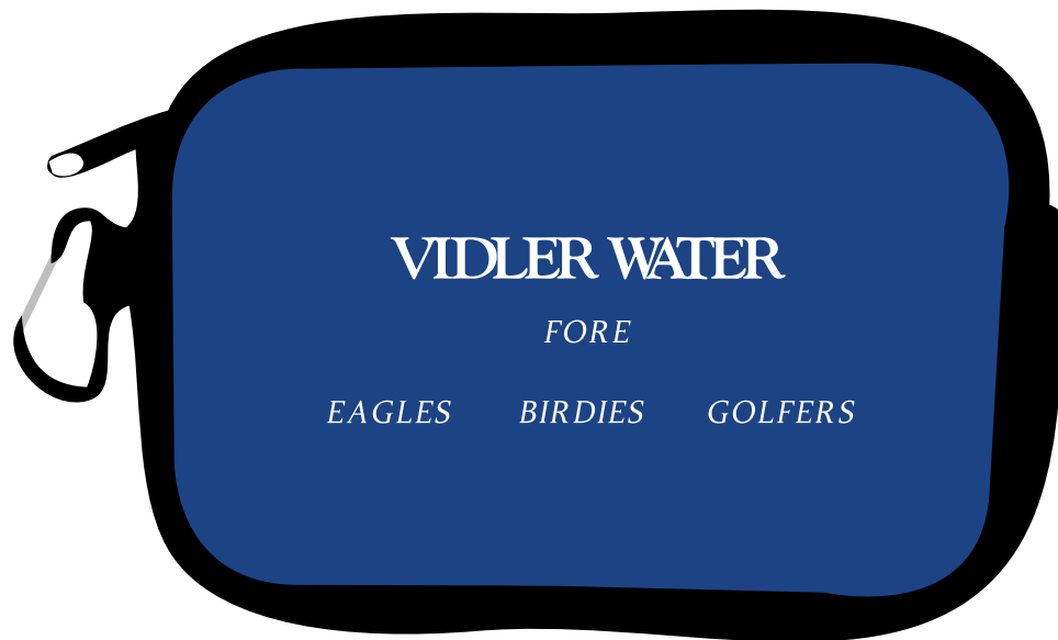
Item shown @ 50% Enlarge @ 200% to see actual size

Order#: 121796 Product: Neoprene Accessory Pouch - Blue Item #: 1097-303920 Imprint Method: Heat Transfer on the First Side - White