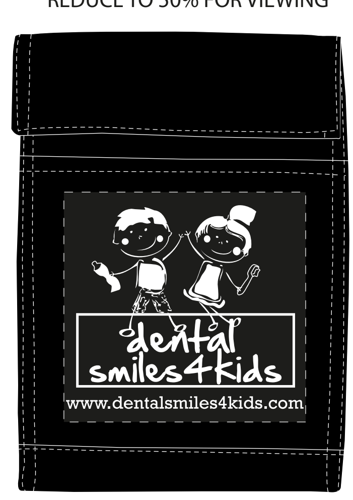
***REDUCE TO 50% FOR VIEWING***