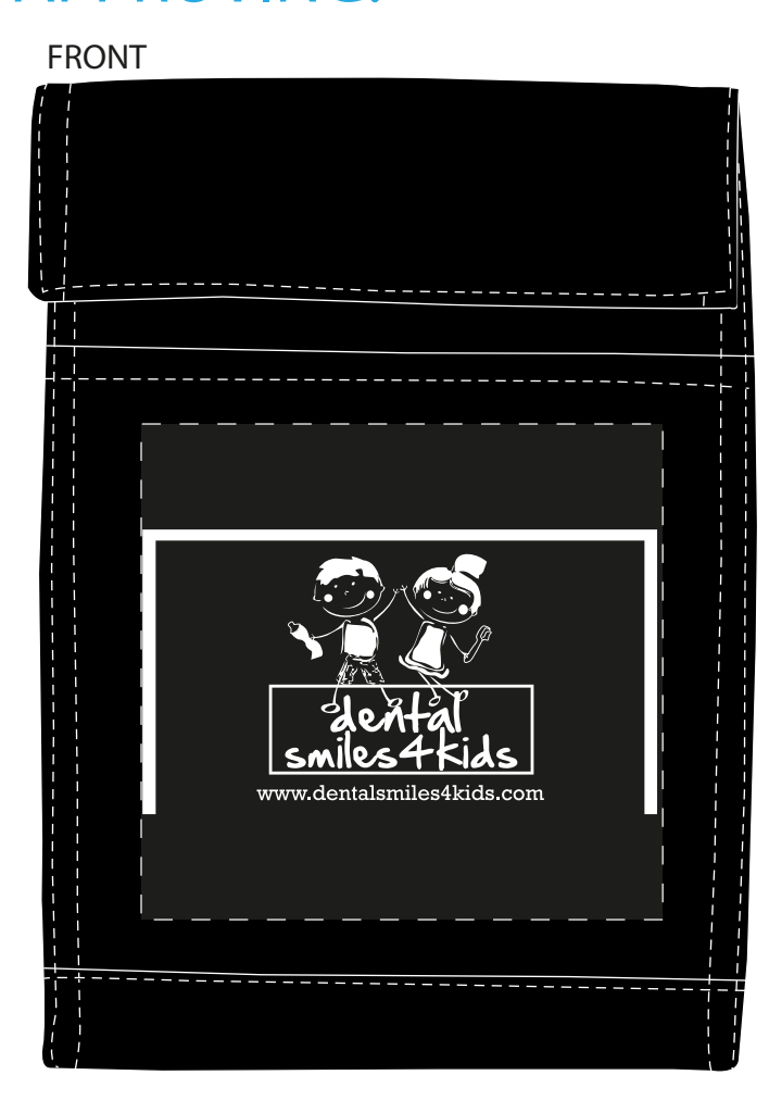
***REDUCE TO 50% FOR VIEWING***