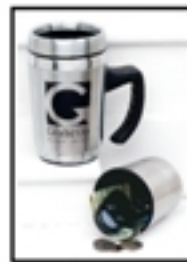
STORAGE IN BOTTOM