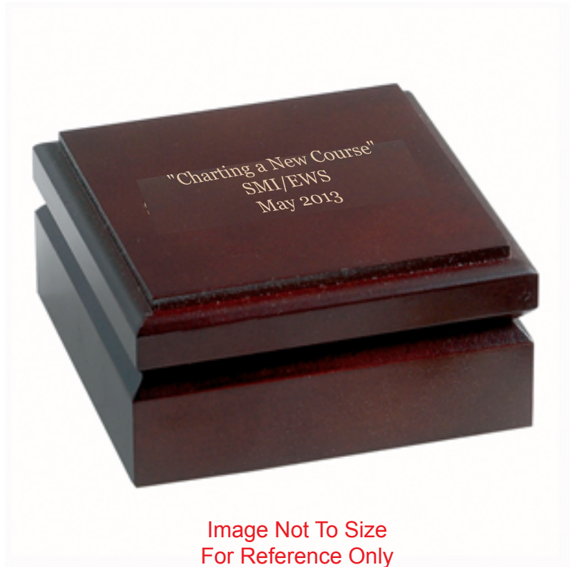
Image Not To Size For Reference Only