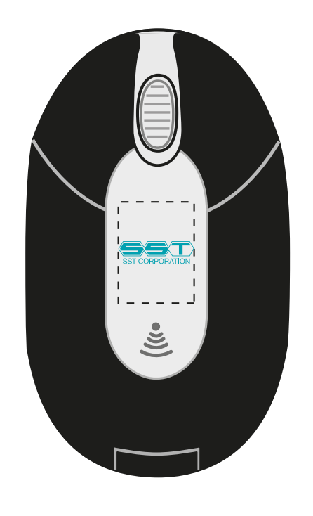
100 % OF ACTUAL SIZE

Imprint Method: Screen Print on the Top - Teal 320