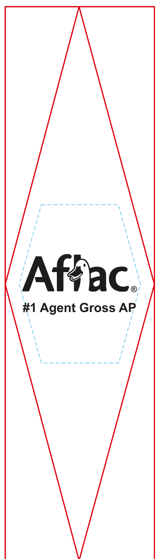
The dotted line indicates the imprintarea