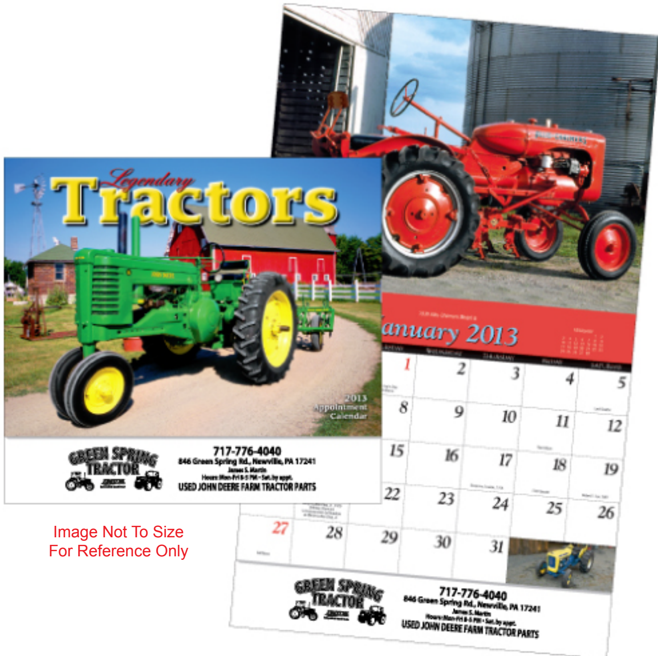
Image Not To Size For Reference Only